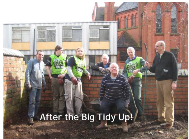
After the Big Tidy Up!

After much work being done on one side of the Synagogue, they felt confident to consider what they could do on the similar sized land to the other side. Faiths4Change supported the organization of a Big Tidy Up event and encouraged local volunteers to get involved in clearing rubbish from the land. Participants worked hard during the day as well as receiving training on Health and Safety, particularly in light of the potential for sharps to be found amongst the rubbish.