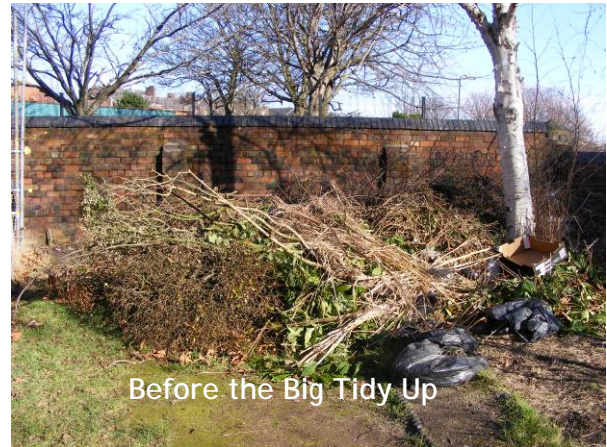
Before the Big Tidy Up

With support from a grant from Faiths4Change, the Synagogue were able to create an area suitable for planting up, using reclaimed railway sleepers. They have planted perennial plants and bulbs in addition to the seeds being tended by the local school children. They also included a small seating area within the grounds for visitors to the Synagogue.