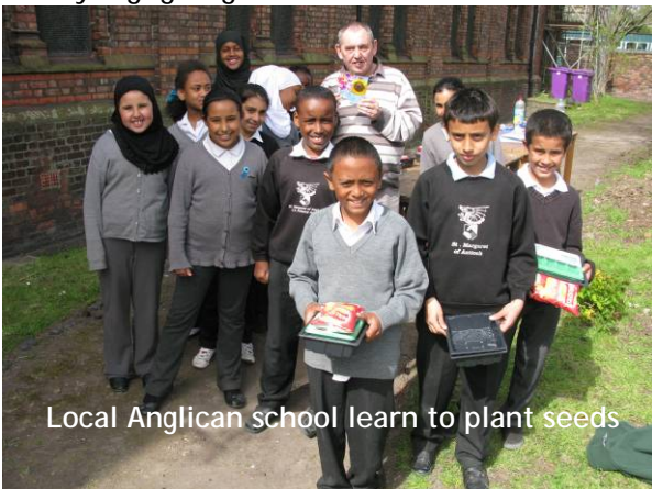
Local Anglican school learn to plant seeds

The Synagogue worked with Faiths4change to develop a plan of action, to make the land more attractive. We supported them to make links with the wider community for support and to share faiths. Brothers of Charity Services, a Catholic Care Service provider, who work with adults with learning disabilities, supported the project by providing horticultural advice and plant sales. The neighbouring Anglican School offered their support by planting sees for the Synagogue and tending the seedlings in school until they were ready to plant out in the Synagogue garden.